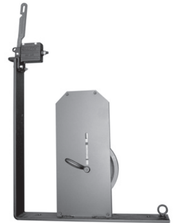
Adjustable Combination Floor Block 600-10818C75A